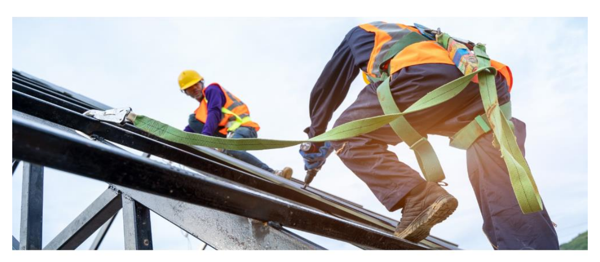
Be First (Regeneration) Ltd: Internal Audit Draft Report Development H&S (including CDM) (2023/24)

Once handed over, the homes will be marketed and available to rent.