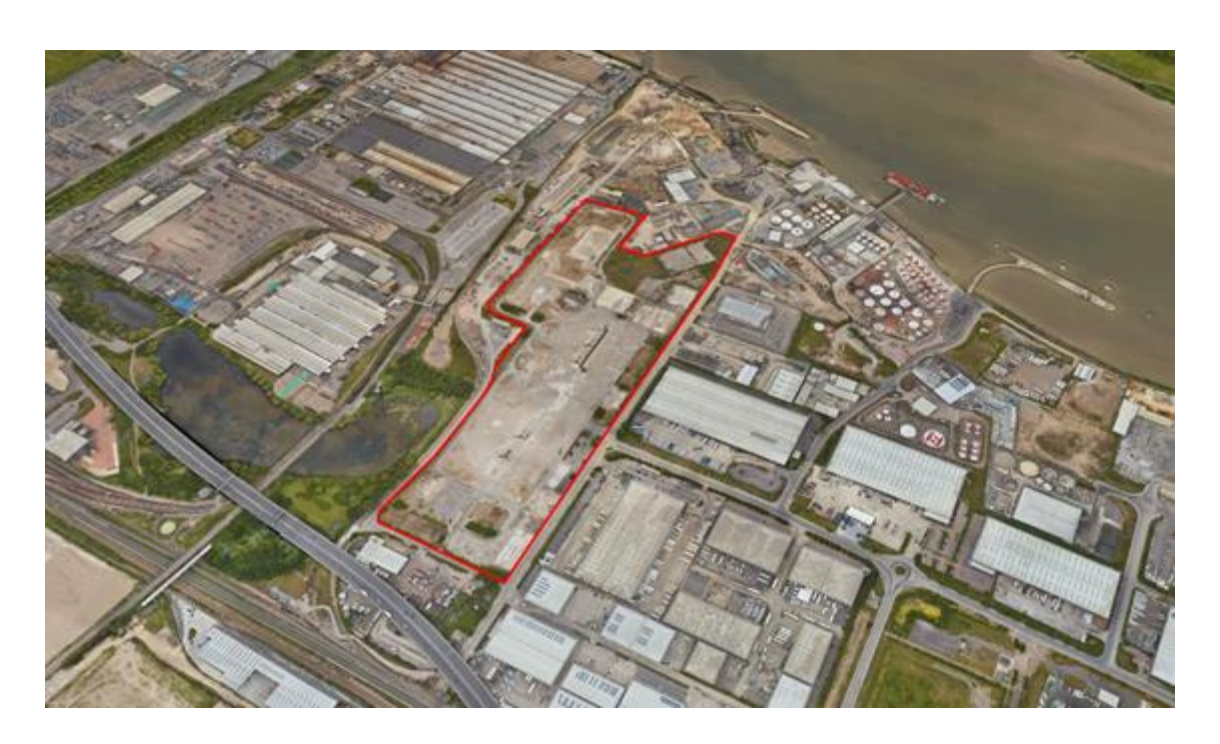
Bringing London's historic wholesale markets to Dagenham Dock - have your say!

The programme is the outcome of an 18-month partnership with Inspiring Futures which connects education, vocational pathways to the wider film studios development and work of Film LBBD (this work was funded by Film LBBD Make It Here and MBS Group).