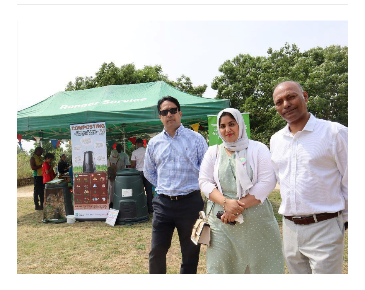
Residents enjoyed a family fun day at Eastbrookend Country Park

Residents and groups can find out more about flag-raising events, including how to donate a flag at <a href="https://libbd.gov.uk/council-and-democracy/flag-flying">lbbd.gov.uk/council-and-democracy/flag-flying</a>.