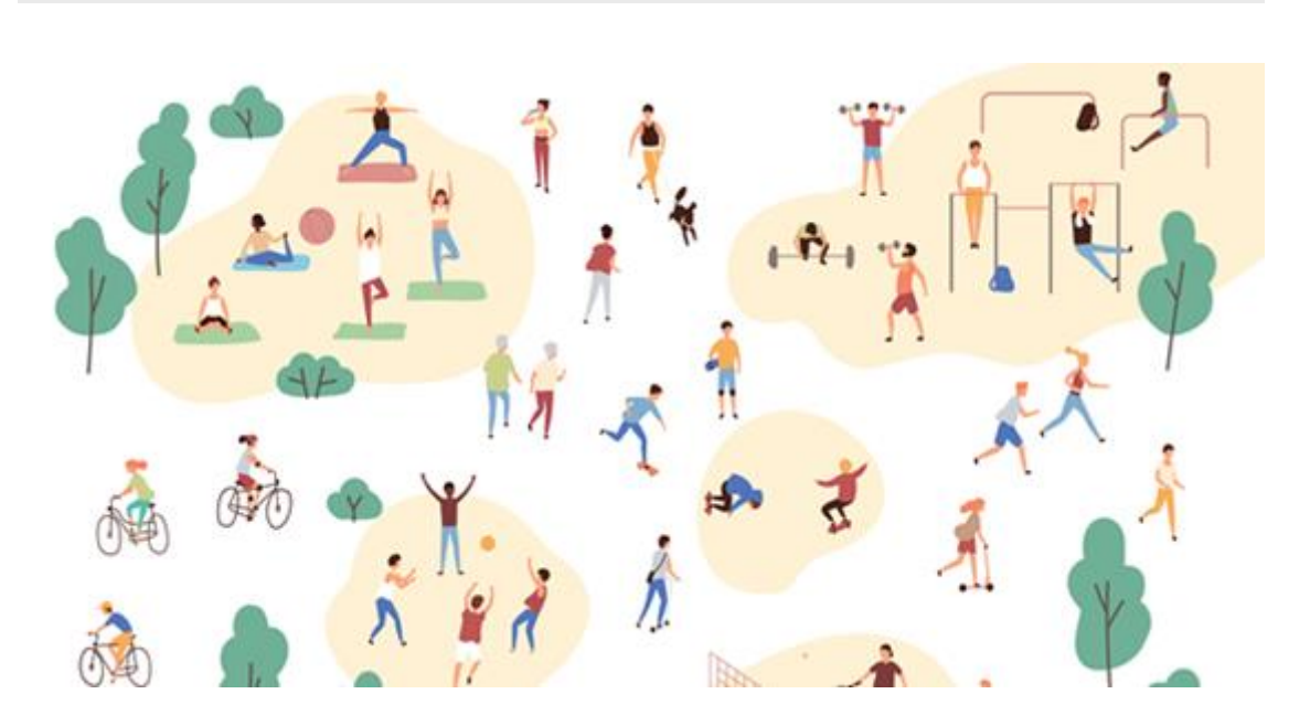
Local groups and organisations invited to apply for £1,000 to run activities in our parks

Residents can find out more by contacting our Fostering service on 020 8227 5988 or visit <a href="mailto:lbbd.gov.uk/fostering">lbbd.gov.uk/fostering</a>