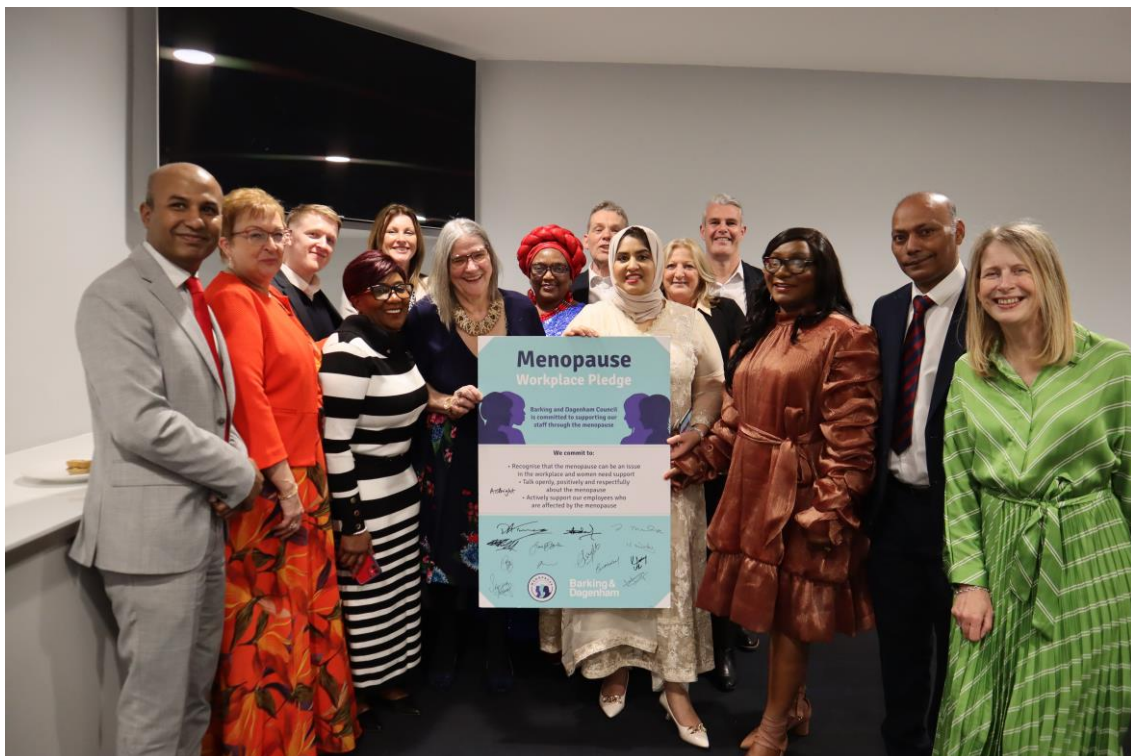
Council signs Menopause Workplace Pledge