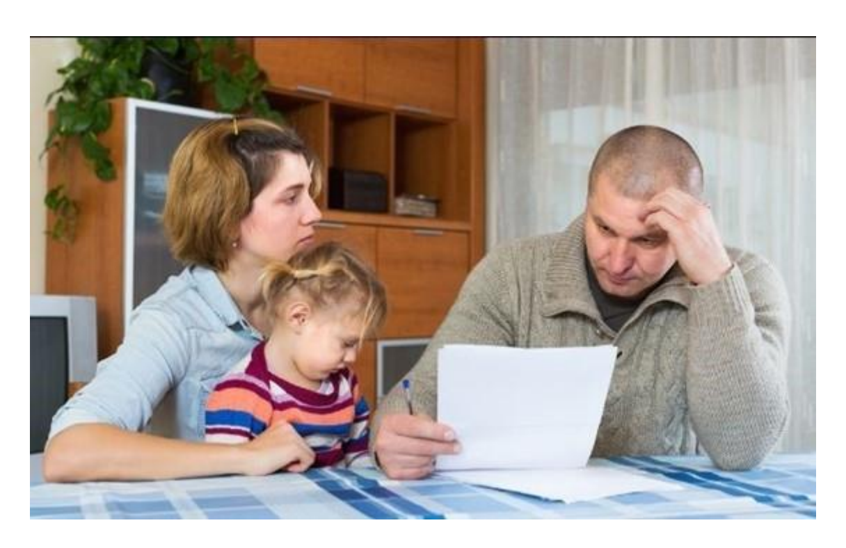
Help and support available for residents through the Household Support Scheme

You can find out more about the School Uniform Bank Project here.