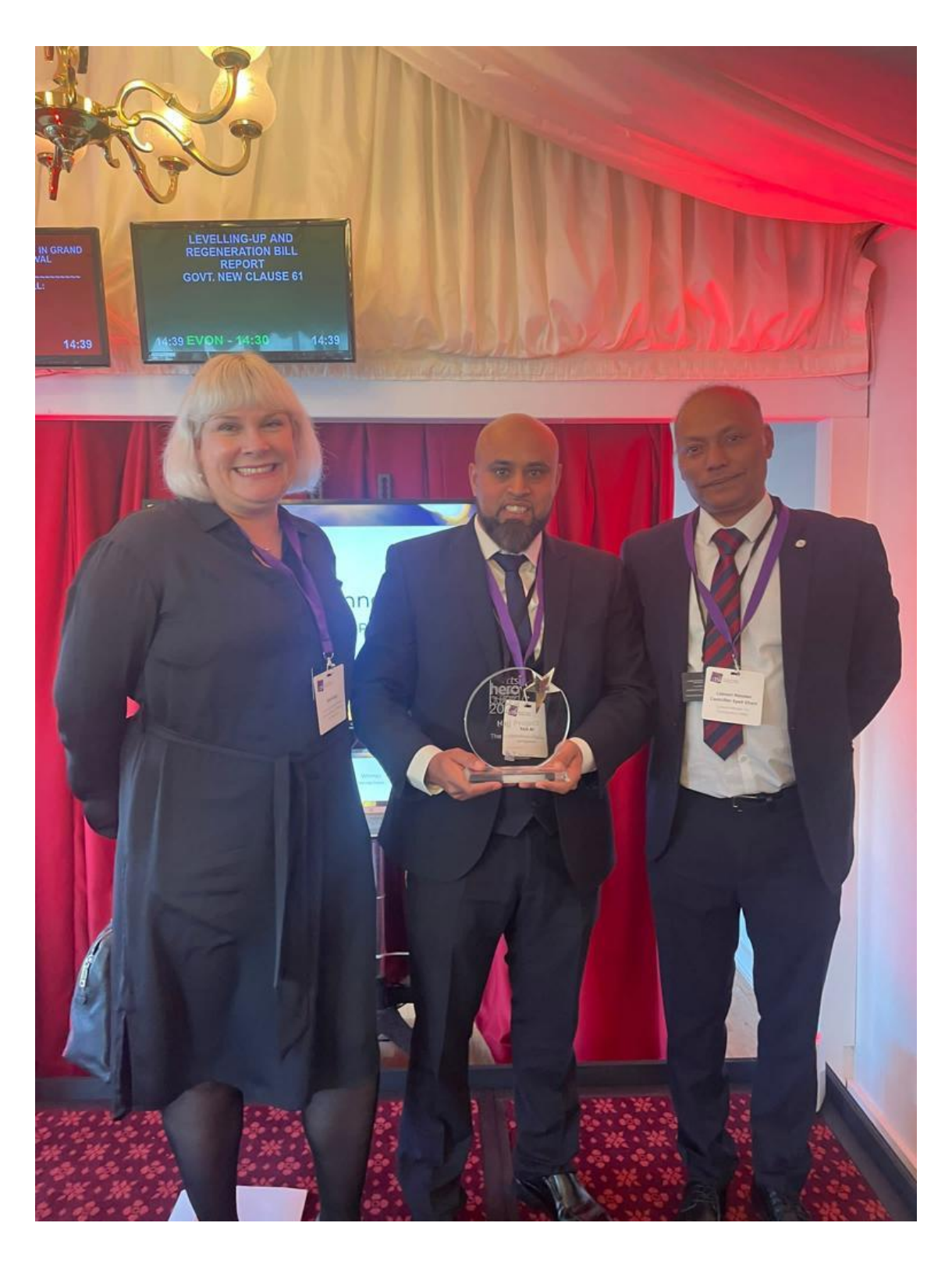
Council's Trading Standards Hajj project scoops industry award